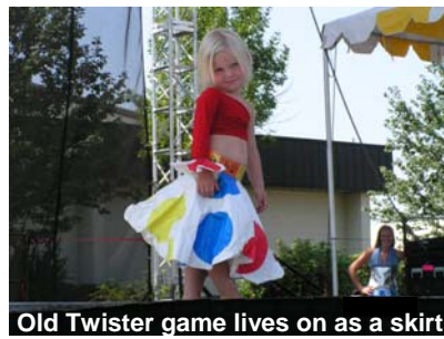
Old Twister game lives on as a skirt