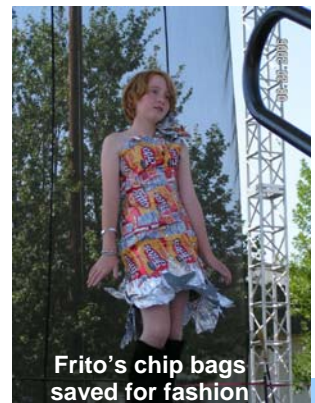
Frito's chip bags saved for fashion