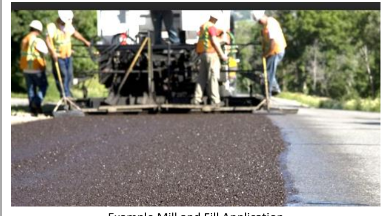
Example Mill and Fill Application