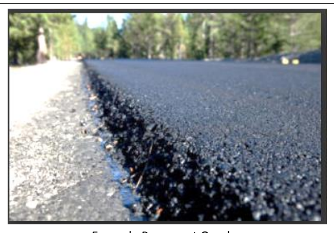
Example Pavement Overlay

The moment the asphalt surface starts to age, there is a high chance that it will start to crack and become unstable. An asphalt overlay can restore the ability of the surface to handle all forms of heavy traffic on its sealed and smooth surface. Dust and loose stones from the old asphalt will also be minimized and covered beneath the overlay. This work can help reduce noise levels, enhance ride quality, as well as reduce the complete life cycle values of the surface.