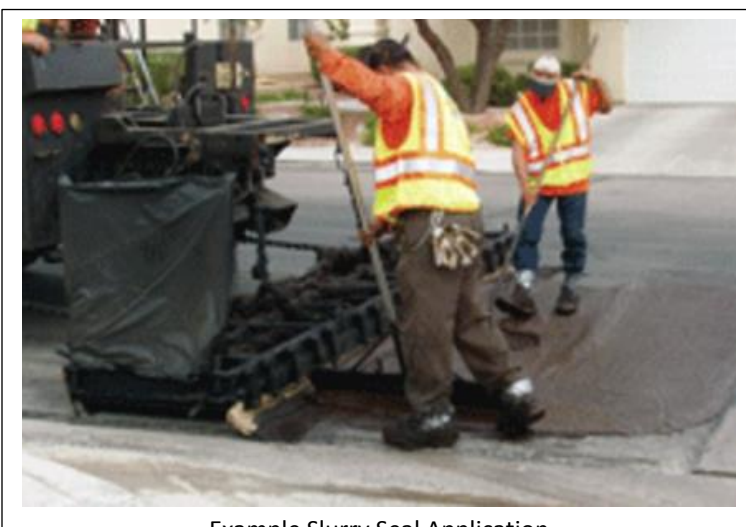
Example Slurry Seal Application

The asphalt emulsion and aggregates are mixed in a truck that distributes the slurry over the pavement. Works with squeegees follow behind and assist in spreading the mixture.