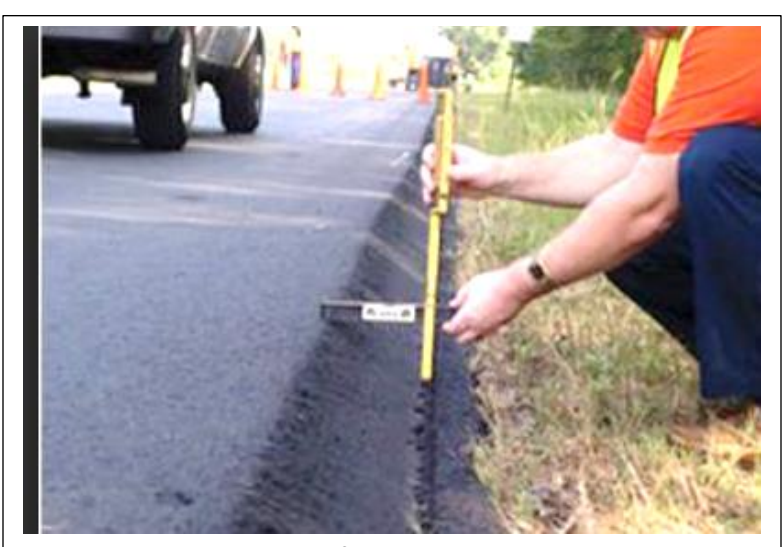
Example Safety Edge Application

Pavement edge drop-offs (height differences between a paved road and the adjacent graded material) have been linked to crashes. The Safety Edge is an effective solution